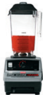
Drink Machine Advance